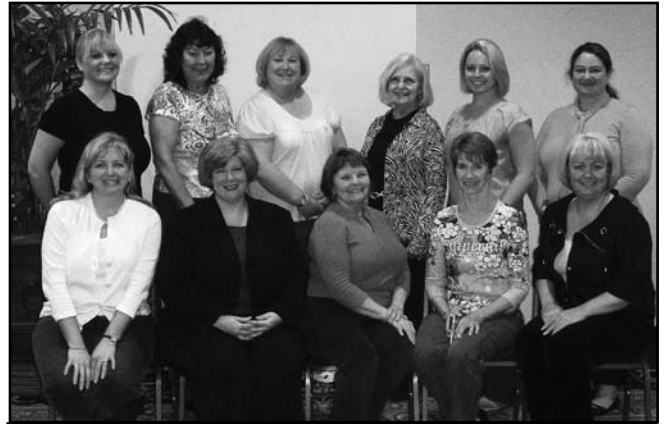
Women and the Law Committee meeting attendees.