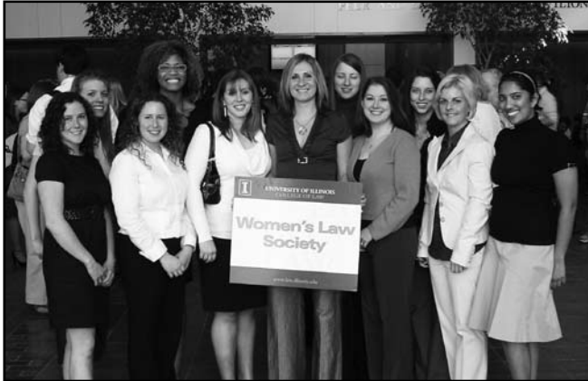
U of I Women's Law Society members participating in the ISBA program.

The following photos all relate to the University of Illinois outreach effort undertaken by the Women and the Law Committee to connect with the women law students there on April 23-24, 2009.