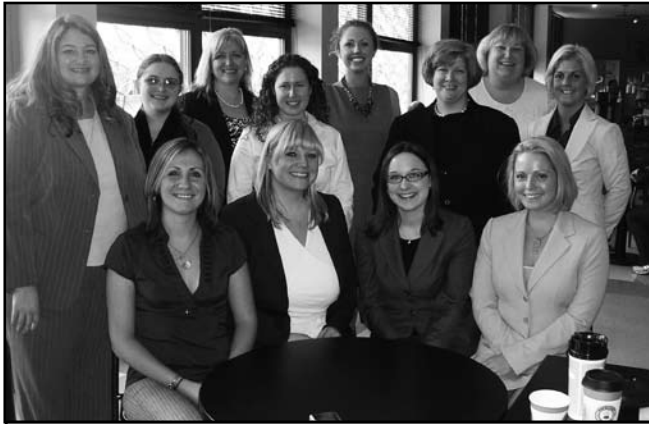
U of I women law students and Women and the Law Committee members.