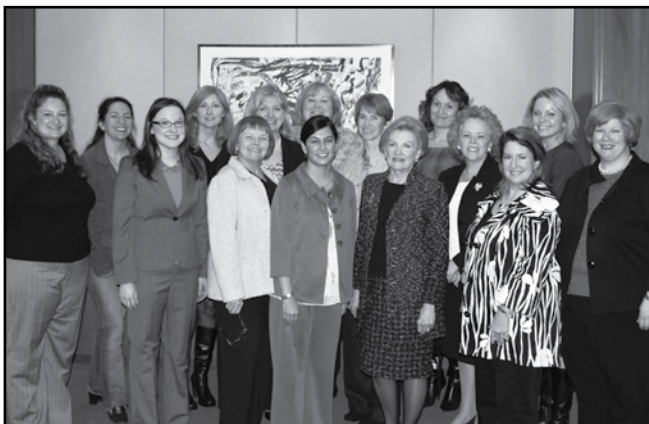
Women and the Law Standing Committee members and past chairs attending the March 6th special program "Having It All and Giving Back: Special Challenges Faced by Women Attorneys" in recognition of International Women's Day and National Women's History Month.