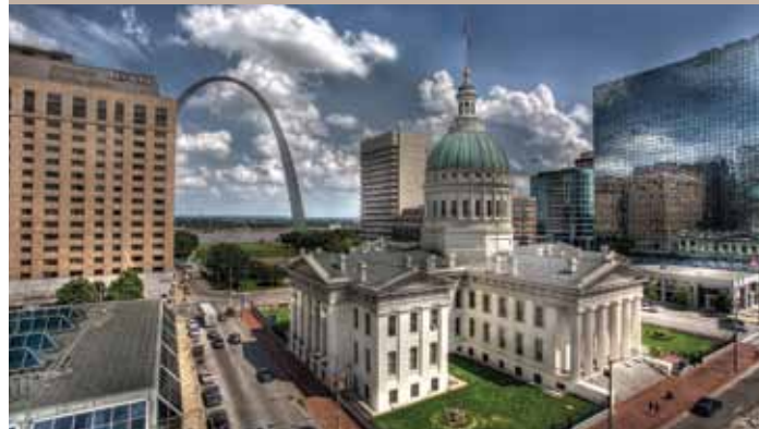
The Old Courthouse, site of the Dred Scott hearings.