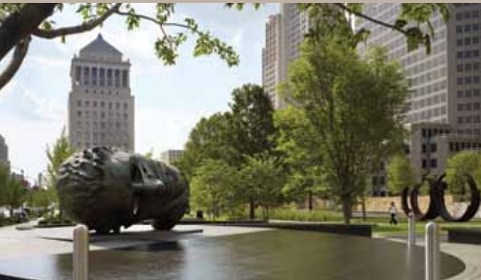
“Eros Bendato” by Igor Mitoraj in the new Citygarden.