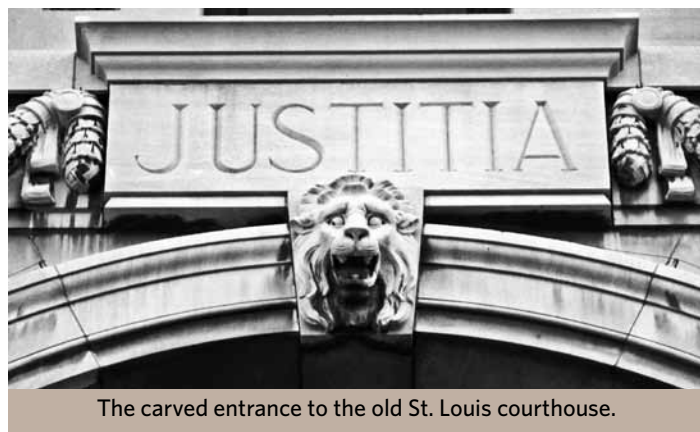
The carved entrance to the old St. Louis courthouse.