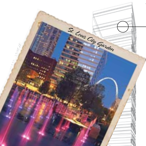
St. Louis City Garden

ATG Trust Company Attorney's Title Guaranty Fund, Inc. Fastcase Go Next Illinois Bar Foundation Illinois Legal Aid Online ISBA Mutual Insurance Company ISBA Publications & Membership Services Lawyers Assistance Program Lexis Nexis Marsh Affinity Group Services